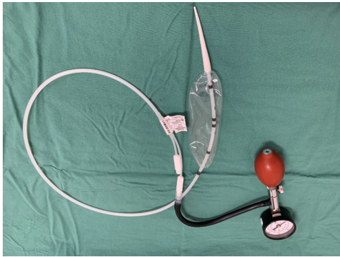
Figure 1 Rigiflex™ pneumatic balloon dilators.

significant patient discomfort, and managing the risk of aspiration. Balloon dilation can be performed under either sedation (with the patient in the left lateral position) or general anesthesia (with the patient supine). This is really an anesthetic decision, and particularly relates to the concerns regarding aspiration, but fluoroscopy is certainly more easily performed with a patient in the supine position.